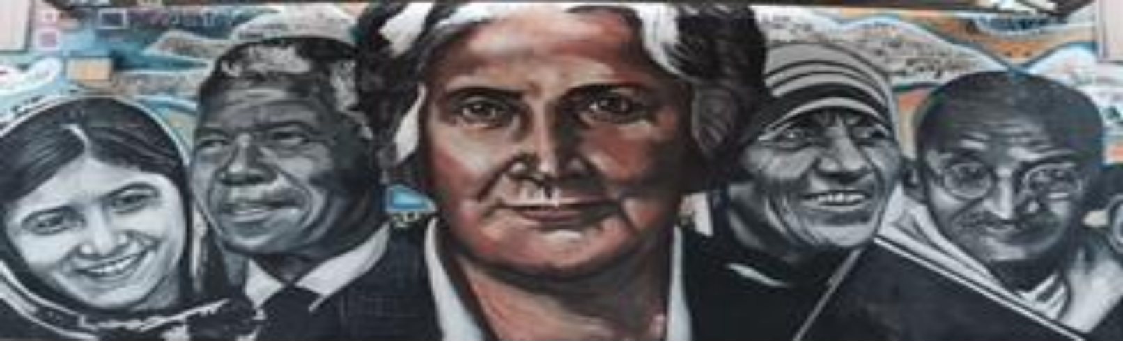
Axson News Crew Fieldtrip last week!