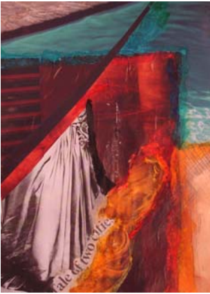
CREATED FROM COLLAGE WORKSHOP