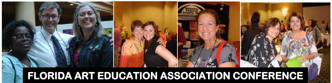
FLORIDA ART EDUCATION ASSOCIATION CONFERENCE