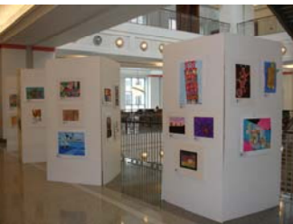
From Elementary Library Show Downtown Library Site